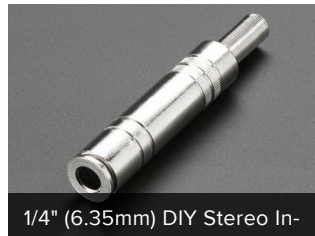
1/4" (6.35mm) DIY Stereo In-