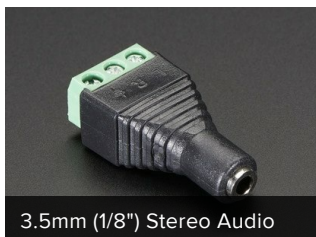
3.5mm (1/8") Stereo Audio