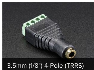
3.5mm (1/8") 4-Pole (TRRS)