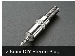
2.5mm DIY Stereo Plug