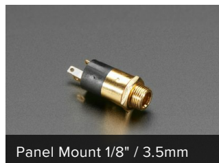
Panel Mount 1/8" / 3.5mm