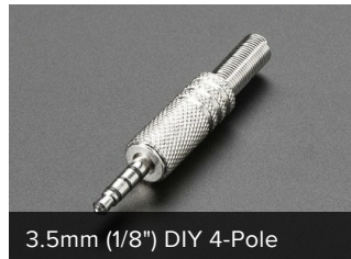
3.5mm (1/8") DIY 4-Pole