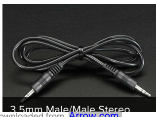
3.5mm Male/Male Stereo