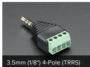
3.5mm (1/8") 4-Pole (TRRS)