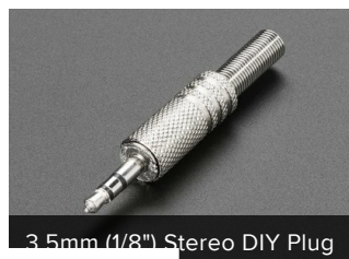
3.5mm (1/8") Stereo DIY Plug