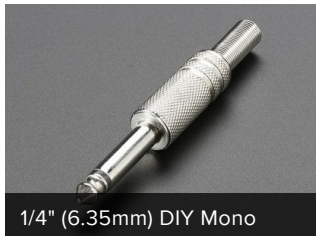
1/4" (6.35mm) DIY Mono