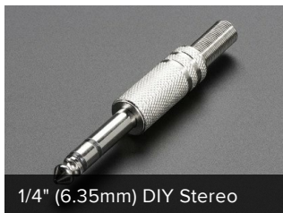
1/4" (6.35mm) DIY Stereo