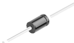
DO-41 Glass case COLOR BAND DENOTES CATHODE