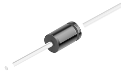
DO-35 Glass case COLOR BAND DENOTES CATHODE