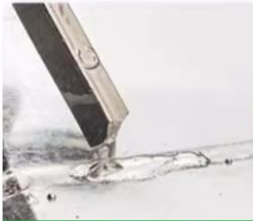
Galvanized sheet welding