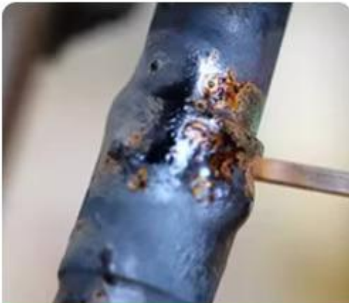
Iron surface welding