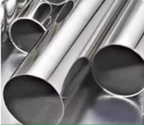
Stainless steel welding

Wide range of application, suitable for most welding needs