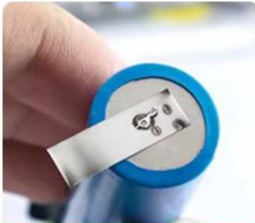
Nickel sheet welding