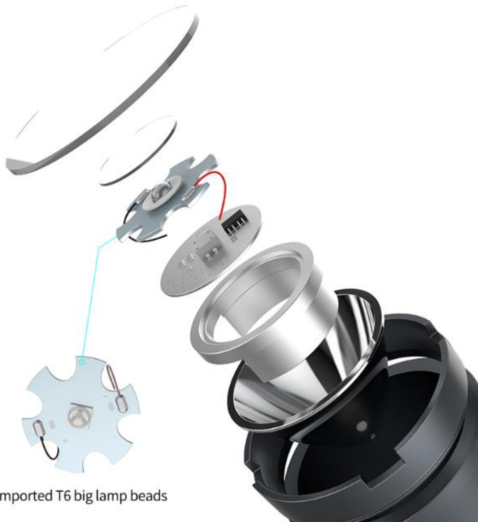
Imported T6 big lamp beads

Using imported high-quality T6 lamp beads design, effective energy saving, not easy to overload, safe and stable, durable