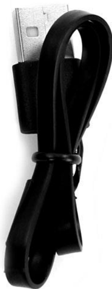
Charging data cable