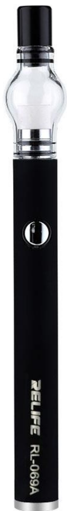
Rosin short circuit detector