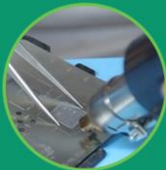
Motherboard planting tin