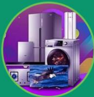
All kinds of electrical maintenance