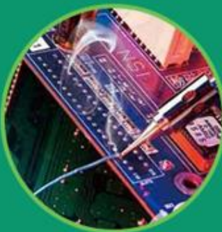
Circuit board planting tin