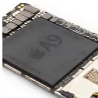
Mobile phone chip welding