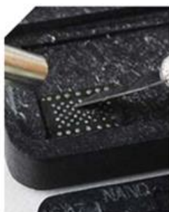
Repair and desoldering