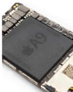
Mobile phone chip welding