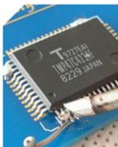
Repair drag welding

Suitable for sensor, wire, SMT repair, circuit welding, tablet phone computer repair, home appliance repair, etc.