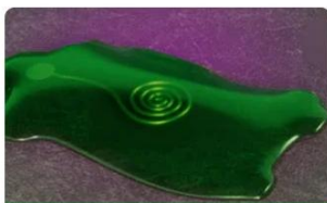
Jumping wire welded into coil

Insulate and protect the electronic components after welding, repair the peeling or partial damage of the solder mask layer of the PCB circuit board, fix the enamelled wire, and protect the components. It is suitable for professional fixing of tail plugs, screw posts, Jumping wire, pads and other parts