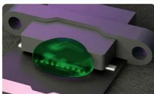
Mobile phone tail plug fixed