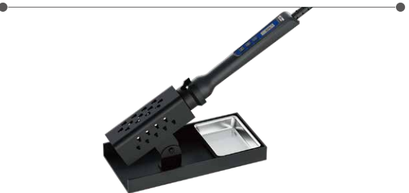
Metal iron stand, sturdy and durable