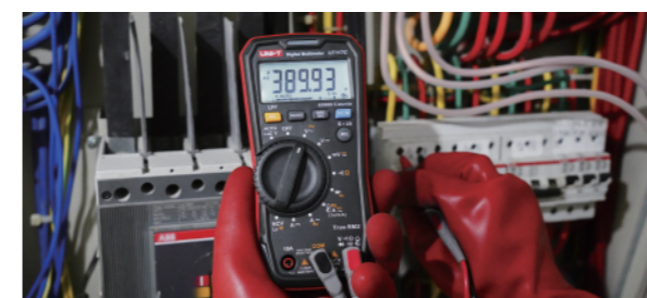
AC voltage measurement