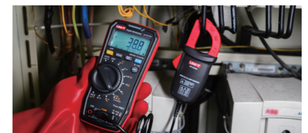
AC Current measurement