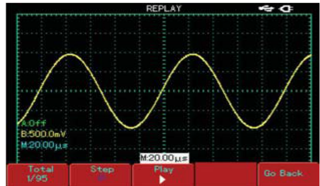
Recorded waveform replay