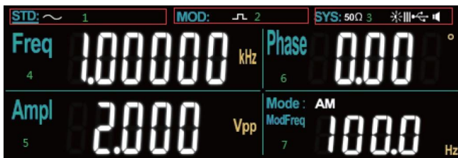
Single Channel, Clear and easy functional interface