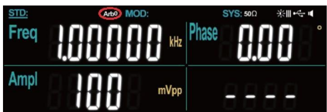
Arbitrary wave output