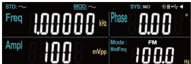
Easy to use modulation type